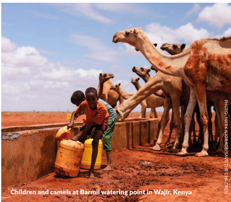
Children and camels at Barmil watering point in Wajir, Kenya

In Zambia and Malawi, children also made links between climate and health problems caused by heat exposure, water scarcity and contamination and increased prevalence of diseases such as cholera. They also shared stories of damage to roads and school infrastructure during floods which impacted children's access to education.